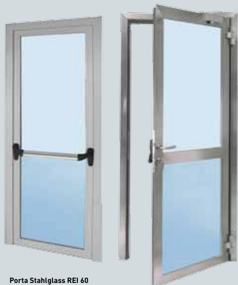
Porta Stahlglass REI 60 ad un'anta, con dispositivo antipanico Novoguard. Stahlglass one leaf, Novoguard device.